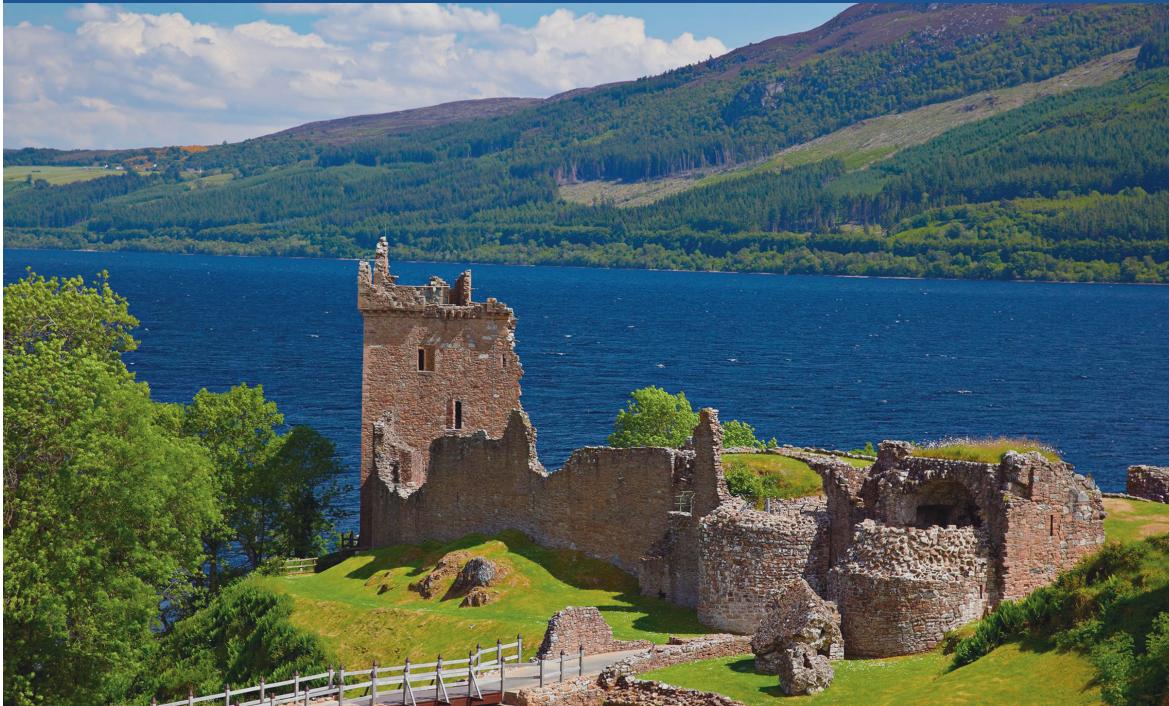
Urquhart Castle, Loch Ness, Scotland

AULD LANG SYNE CHARLIE IS MY DARLING OH! ARRANMORE